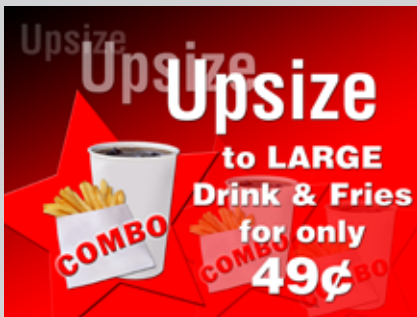
Animated Marketing Message