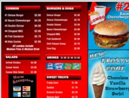
Sample Menu with Upsell Message